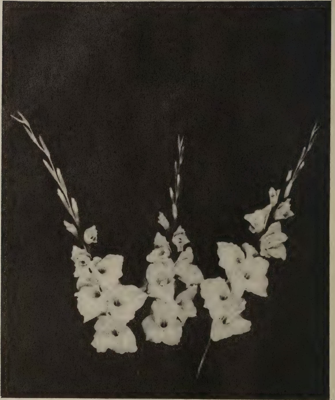
Leading Lady from medium size bulbs